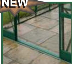
Ground level access