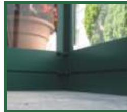
Built in base section