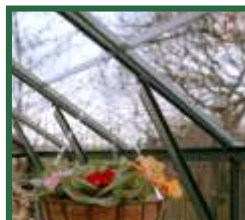
Hanging Basket Rails