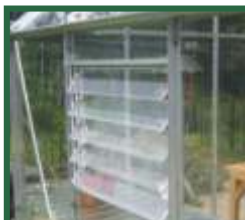
5 blade louvre