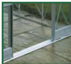
Ground level access