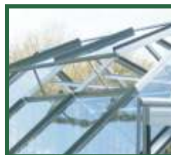
Double roof vent