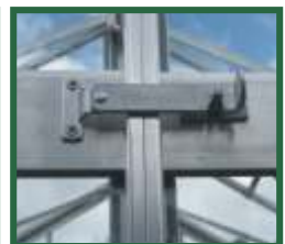
Double door catch