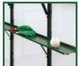
6" wide extruded shelf

Many accessories available please visit our website for more details.